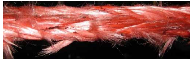
Fig. 1: Example of fringe formation.

Since the use of high-strength fiber ropes in swimming pools is still a new field, we recommend that a suspension rope should be subjected to an annual tensile test during the first years of operation in order to detect any deterioration in good time. As a general rule, we recommend that textile fiber ropes should not be used permanently for more than 10 years and should therefore be replaced regularly.