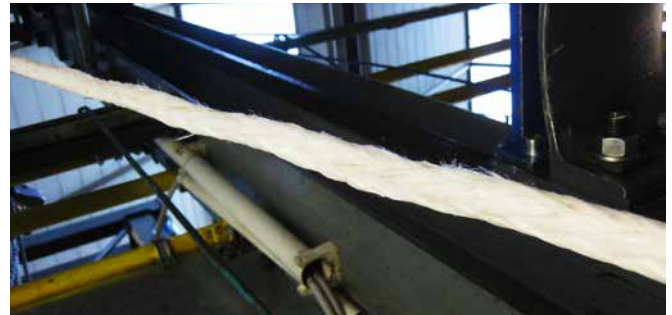
Fig. 2: Example of waviness. [Jakob AG / Uni Stuttgart]